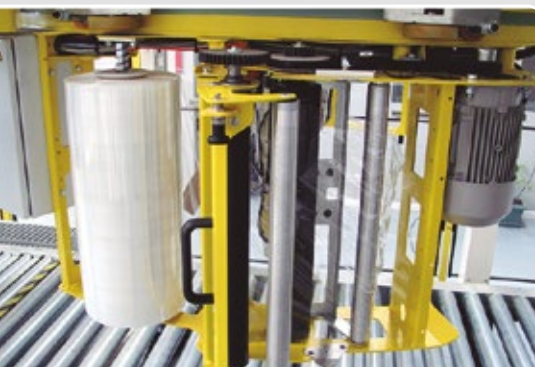
Quick-Load: Quick change of the reel