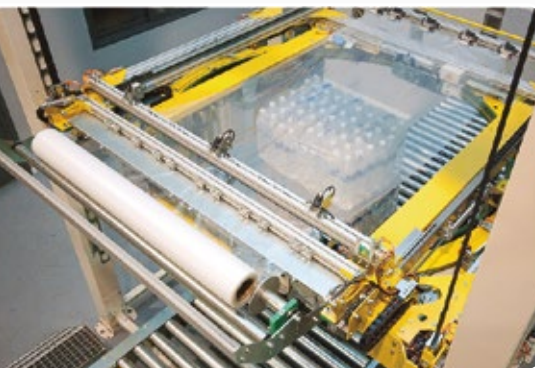
Top sheet dispenser: anti-dust / anti-rain